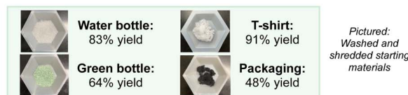
(b) Depolymerization of polyethylene terephthalate without hydrolysis a