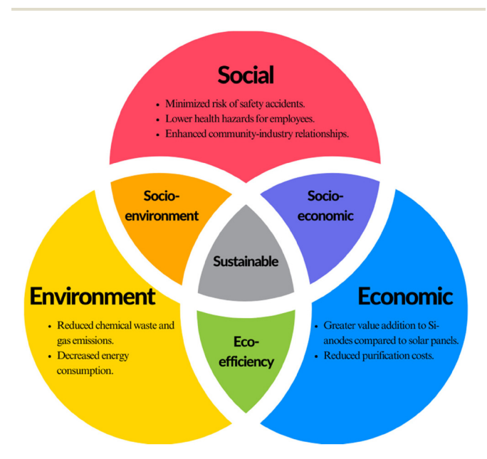
Fig. 3 Triple bottom line assessment Venn diagram.

Recovered silicon from used solar panels offers multifaceted environmental advantages. Firstly, the ultrahigh capacity of Si significantly boosts the LIB performance, especially in terms of energy density. This indirectly contributes to the proliferation of renewable energy storage solutions, reducing the