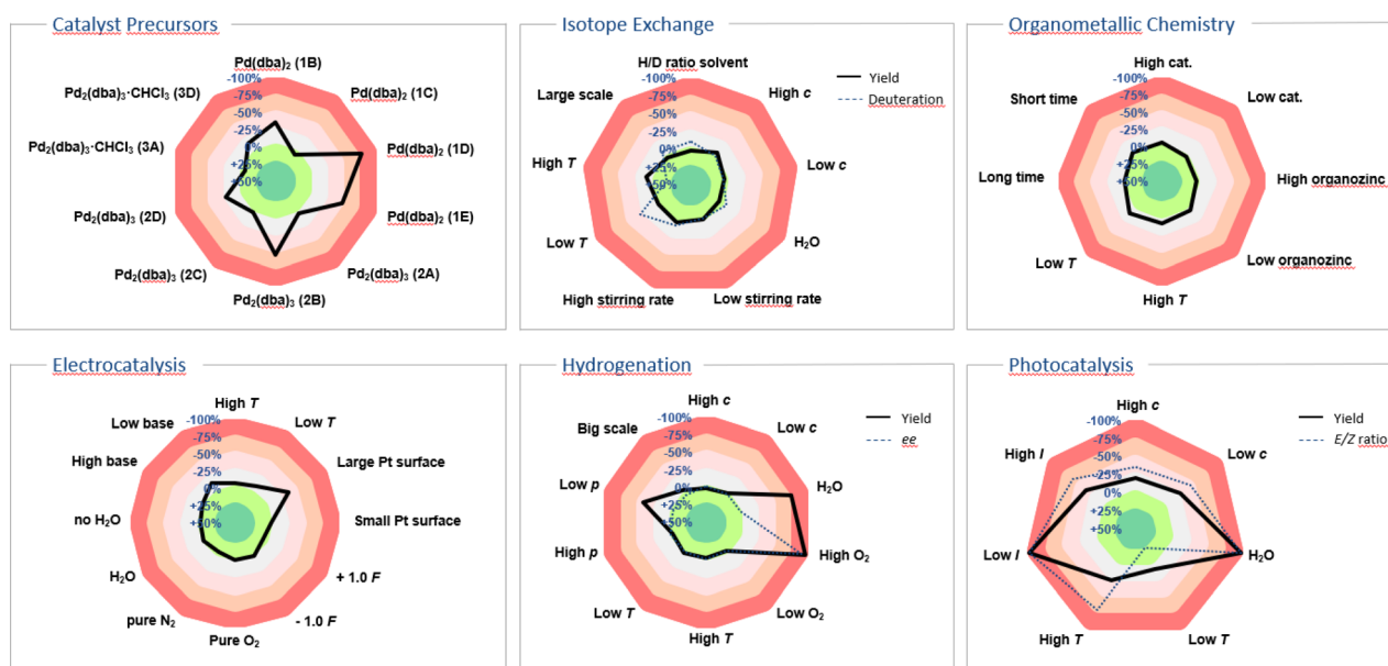
Fig. 2 Examples showcasing sensitivity screens tailored to diverse research fields. 13–16 In instances like hydrogenation, isotope exchange and photocatalysis the sensitivity screen was utilised to illustrate two target values, such as yield/deuterium incorporation, yield/enantiomeric excess and yield/ E:Z ratio, along with the parameters' impact on them.

Our innovation was embraced by the scientific community and has since been widely adopted for applications beyond the originally suggested ones. Originating from a background in photochemistry, we initially considered only yield as the target value and parameters such as: temperature, concentration, oxygen and moisture levels, light intensity, and scale. The use of the sensitivity screen within the scientific community, including our own group, has led to its adoption modified with additional parameters and target values. While the target value was formerly only yield, researchers have suggested and applied conversion, product ratio, selectivity, ee, throughput, TON, radiochemical yield (RCY), molar/specific activity ( A_m/A_s ), H/D -ratio, purity, space-time yield and enzyme activity, 12 and the standardisation of these terms has been a central achievement of the chemical community (Fig. 2). 13–16 Especially for industrial processes with more than one desired product, the reaction can be steered towards a customised product distribution, which might alter given the demand of the chemical product. A radar