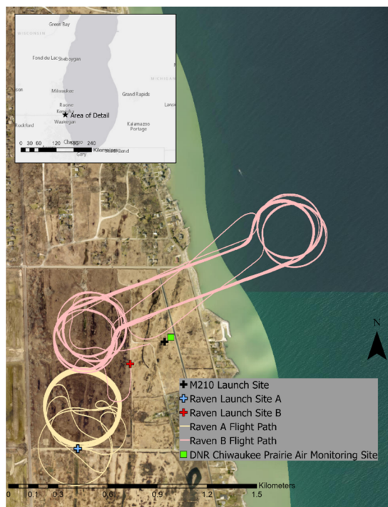
Fig. 1 Research site map: displaying the launch locations of the M210, and RAAVEN for over land flights A (flight path in yellow) and partial over water flights B (flight path in pink).

Chiwaukee Prairie (AIRS ID: 55-059-0019) by the Wi-DNR. The shelter for this monitoring station additionally housed a Doppler lidar during the summer of 2021. Intensive sampling of UAS flights lasted six days from May 21, 2021, to May 26, 2021. In addition to the surface instrumentation, two UAS platforms were deployed to capture information on the vertical structure of the lower atmosphere. A detailed description of the platforms, flight plans and measurement strategies used during WiscoDISCO-21 is provided in Cleary, et al. 32 All data are available through a WiscoDISCO-21 community data repository. 33