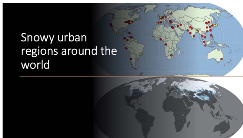
Fig. 2 The top world map shows the major cities of the globe, and the bottom picture shows snowy regions in the world. Note that in the Southern Hemisphere, there are several cities in the mountainous areas which receive snow (white-blue dots). The original graphs were obtained from the public domains made by the public maps made by two organizations: United Nations (UN) and NASA. We herein modified them by giving 3-dimensional effects, and hence the original pictures are changed. 19,20

gases and particles. 13,14 In polluted urban regions, snow has been shown to be effective for uptake of particulate matter, including airborne nanoparticles. 15 Yet, after snow events and upon melting–freezing cycles, the emission of airborne nanoparticles to the atmosphere is observed. 15 In urban regions, vehicle combustion particulate emission has been shown to alter snow composition. 14,16 Furthermore, the usage of salt