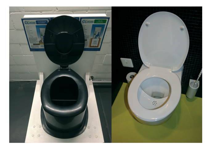
Fig. 1 The Envirosan urine-diverting dehydration toilet (UDDT: left) and the Roediger urine-diverting flush toilet (right).

some popularity as an alternative to conventional dry toilets, especially because they give rise to less odor.<sup>52</sup> In Durban, South Africa, a new law obliged the municipality to provide sanitation to all from 2001, resulting in the installation of double vault UDDTs to serve the areas without sewers.<sup>53</sup> With urine infiltrating the ground and alternate use of the fecescontaining vaults, it was possible to evacuate the vaults in a relatively safe way to gain organic matter for soil improvement. However, whereas Europeans are largely in favor of urine-separating flush toilets, albeit quite critical with respect to the toilet technology available,<sup>51</sup> the UDDTs are not at all popular in Durban.<sup>54</sup> With the flush toilet being the standard solution in the affluent parts of Durban, the affected population considers dry sanitation an unattractive and unjust solution for the poor.55