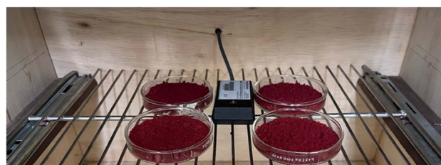
Fig. 2 UVFP samples placed in the UV-C chamber for treatment with UV-C radiation.

Based on initial screening results, the sample treated with a UV-C dose of 1.25 \times 10^{-3} \text{ J cm}^{-2} exhibited the highest betalain content and antioxidant capacity. As a result, this dose was selected as the optimal treatment for the UV-C-treated freeze-dried beetroot powder (UVFP). The treatment was carried out in a UV-C chamber (Fig. 2), with an exposure time of 240 s to achieve the selected treatment dose. Following UV-C