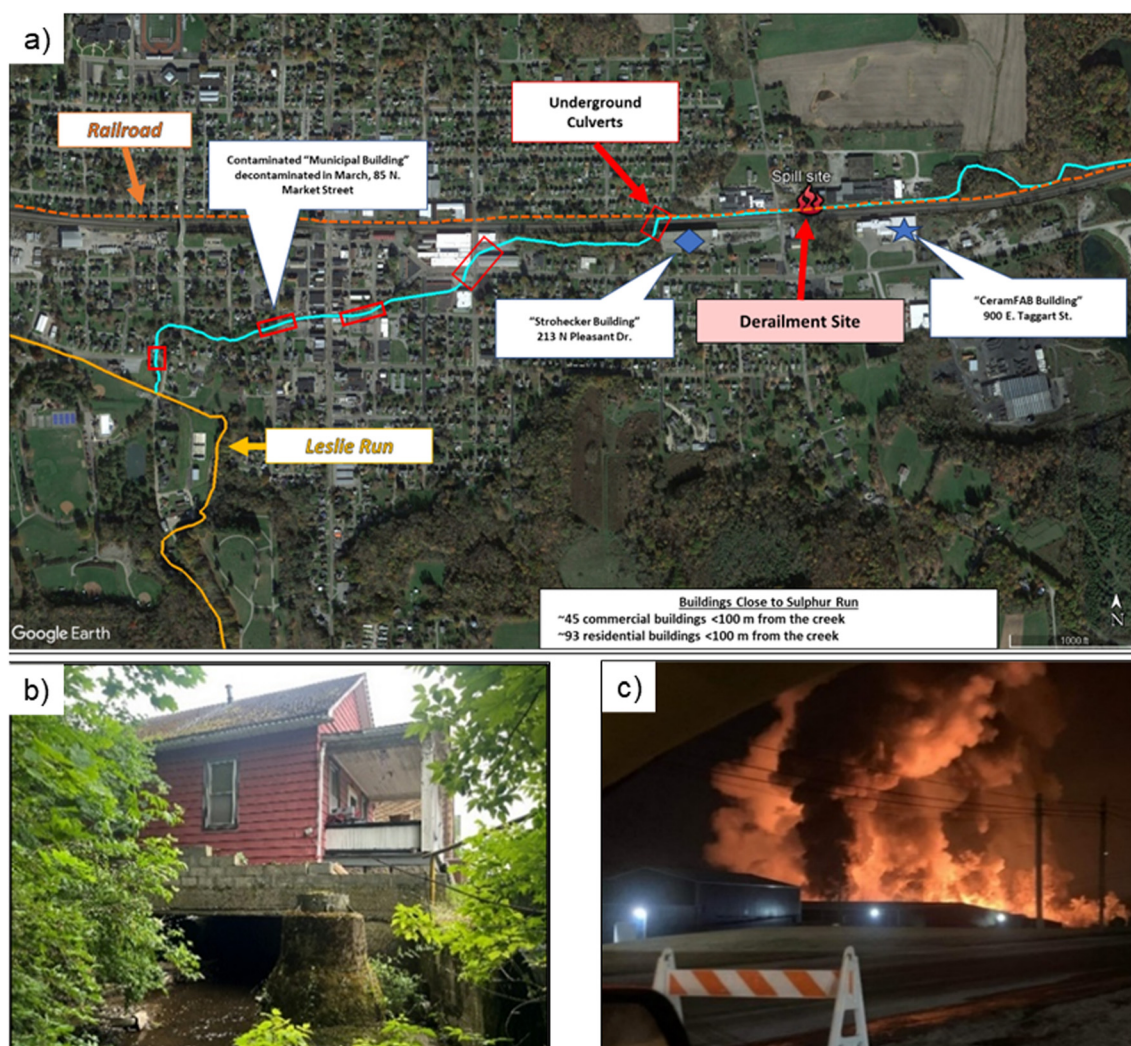
Fig. 1 a) Map showing the derailment site, culverts, and contaminated buildings near Sulphur Run, b) chemicals released from the derailment entered Sulphur Run and flowed into concrete culverts underneath residential, commercial, and municipal buildings, c) image of the chemical fire visible from East Taggart Street by the CeramFAB Building on February 3, 2023. This image was taken before the open burn was conducted February 6, 2023.

During the following months, concerns were raised about the fate of chemicals released as the derailment occurred on the Eastern side of East Palestine next to Sulphur Run creek (Fig. 1). Sulphur Run received spilled chemicals and runoff from the firefighting operations. Chemicals from the derailment site and roadways reached storm drains and Sulphur Run during the initial response (ESI-Context section†). Chemicals spilled into Sulphur Run flowed through East Palestine, as well as directly by and underneath more than 130 residential, commercial, and municipal buildings through concrete boxed and corrugated metal culverts, and under bridges. Doors and windows of some buildings were less than 5 feet from the creek. At East