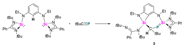
Scheme 2 Reaction of [LSiCSiL] and t BuC≡P.

Next, we investigated the reaction between the diamino-benzene-functionalised bis-silylene [LSiCSiL] 9 (C = 2,6- \{(\text{EtN})_2\text{C}_6\text{H}_3\} ) and t BuC≡P 29 (Scheme 2). After stirring both precursors at room temperature for 30 min, all the starting materials were consumed. Concentrating the solution and storing in a –40 °C freezer resulted in the formation of single crystals of the cyclic reaction product 2 , which significantly differs from 1 . The molecular structure of compound 2 was determined via SCXRD analysis and is depicted in Fig. 2. Compound 2 crystallises in the triclinic space group P \bar{1} and the core structure comprises a seven-membered SiC 2 N 2 SiPc