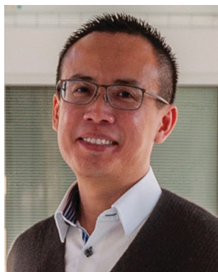
David Y. W. Ng

† Electronic supplementary information (ESI) available. See DOI: https://doi.org/10.1039/d2tb00812b