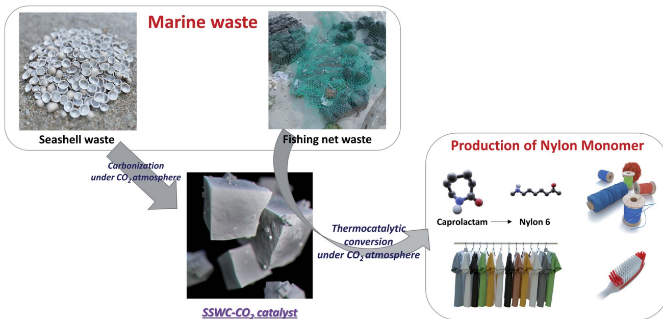
Fig. 1 Conceptual diagram of marine waste upcycling proposed in this study.

The preparation of catalysts from waste materials is another waste-upcycling method. Utilizing waste materials to prepare