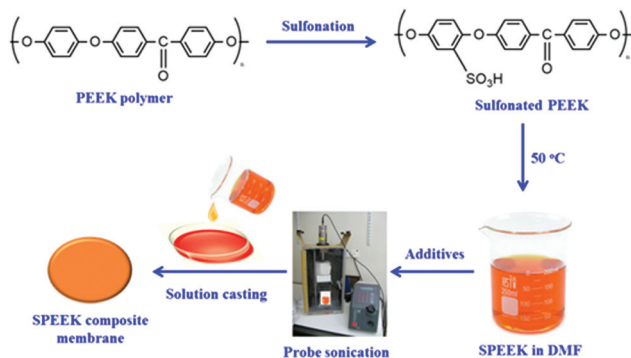
Fig. 5 Schematic preparation of SPEEK membranes.

Poly(ether ether ketone) is a thermally stable, chemically resistant, and mechanically stable material. However, it cannot be directly used in fuel cell applications because of its fully hydrophobic segments. Hence, introducing the sulfonic acid group into PEEK polymer enhances the hydrophilicity, solubility in polar solvents, ion exchange capacity, and transport number. The solubility of the SPEEK membrane is reported as follows; (i) if the degree of sulfonation (DS) is around 30%, then it is soluble in DMF, DMAc, DMSO, and NMP under hot conditions only (ii) if the DS is around 40–70%, it is soluble in DMF, DMAc, DMSO, and NMP at room temperature (iii) if the DS is above 70%, it is soluble in methanol, and (iv) if the DS is 100%, it is soluble in hot water. 41