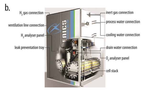
Fig. 1 (a) A schematic illustration of a simple U-tube configuration for water electrolysis. Voltage penalties (overpotentials) increase the total voltage required to operate the system at a given rate relative to the thermodynamically required potential, and include the kinetic overpotentials associated with the hydrogen-evolution and oxygen-evolution reactions (\eta_{\text{HER}} \text{ and } \eta_{\text{OER}}, \text{ respectively}), \text{ the concentration overpotential } (\eta_{\text{con}}), \text{ and } ohmic resistance loss ( \eta_{\text{ohm}} ). The total operating voltage of the system is given by the sum of the thermodynamic voltage for the water-splitting reaction and the total overpotential, \eta_{\text{total}} , for the system. (b) A schematic illustration of a commercially available (Hydrogenics) alkaline water electrolyzer with auxiliary components.7

transfer between most metal electrodes and a species in solution are slow for complex, multi-step electrochemical reactions, including reactions as simple as the two-electron reduction of two protons to form a single molecule of H<sub>2</sub>. <sup>12,13</sup> The overpotential partially overcomes the activation barrier for such processes, with the exact partitioning of the potential between the liquid and the kinetic barrier depending on the details of the system. Assuming an Arrhenius-type relationship for the interfacial charge-transfer kinetics yields an exponential relationship between the overpotential and the rate, or current density, j, of the reaction of interest: