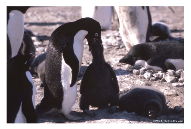
Fig. 2 An Adèlie penguin feeding its chick.

After the calving of the Nansen Ice Shelf (Ross Sea) in 2016, the foraging ground of Adèlie penguins (Fig. 2) changed and penguins fed in this newly accessible sea area.<sup>41</sup> A linkage between food item, ice coverage, foraging range, and POP contamination in Adèlie penguins from a rookery in the Ross Sea (Fig. 1) was already reported in the 1990s.<sup>44</sup> Here, a sequence of events occurred in the 1995/96 summer season: the ice melted completely very early in the season and penguins during the rearing chick period foraged nearer to the shore to save energy instead of swimming offshore for feeding on krill. The penguin diet during the rearing period is based on krill, which