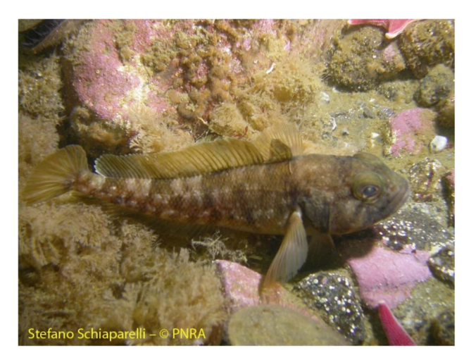
Fig. 3 A specimens of Trematomus bernacchi.

In order to compare with and complement observations in the Arctic, the following discussion focuses on POP temporal trends in marine fish and Adèlie penguins. These species are native to Antarctic marine environment and thus suitable to study temporal changes in contaminant exposure in this region. The Tables 1-4 report the concentrations of POPs in the most studied fish and penguin species. Among POPs, we selected PCBs, p,p'-DDT, p,p'-DDE, DDTs, and HCB since other chemicals, including emergent contaminants, were reported only in few articles.