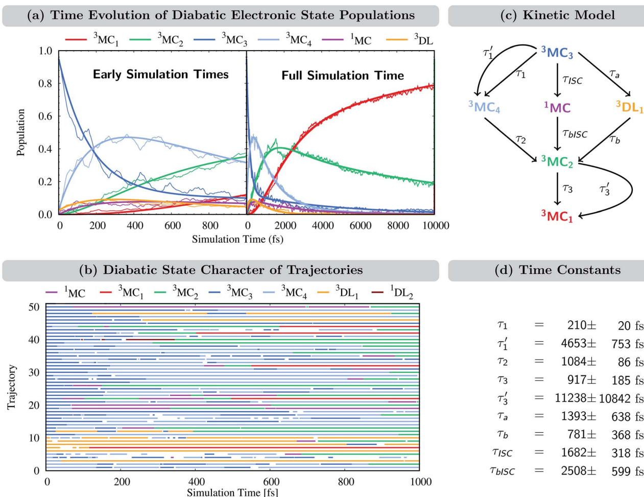
Fig. 4 (a) Time-evolution of the diabatic electronic state populations. Thin lines represent state populations and thick lines represent fitted curves. (b) Time-resolved diabatic state character of 50 sample trajectories. Colors indicate the dominant character, summing up to at least 60% of the total population for each trajectory (this threshold allowed an average assignment of 95%, i.e. 19 000 of the 20 000 time steps for each trajectory; see Fig. S7† for a more strict threshold of 70%, which accounts for 87% of the simulation time). Blank spots indicate that no dominant state could be assigned at a particular time step. (c) Kinetic model used to fit the time evolution of the populations. (d) Fitted time constants including error estimates obtained using the bootstrap method with 100 copies. 66

^3\text{DL} states, the excitation energies of the L1C states are likely to be overestimated by LR-TDDFT – as LR-TDDFT includes only single excitations – while standard hybrid functionals such as the employed B3LYP functional also tend to underestimate the energies of CT states. It is also interesting to discuss whether other DFT-based methods such as spin-flip TDDFT 64 (SF-DFT) or a \Delta\text{SCF} approach 65 should, in principle, be able to provide a better description of the electronic states of V^{III}Cl_3(\text{ddpd}) than “standard” LR-TDDFT. While SF-DFT can be used to describe multi-configurational ground states of open-shell systems 64 by applying a LR-TDDFT approach from a spin-flipped reference state, this is only reasonable if the reference state itself can be described as a single configuration. As shown in Fig. 2, this is problematic due to the near-degeneracy of the excited states, both among the triplet and the singlet manifold. Even if it was possible to choose one of the two excited states with rather unique electronic configurations, i.e. , the S_7 state or the T_9 state, the subsequent success in SF-DFT calculations would be questionable. Due to the (e_g)^2 configuration of the T_9 state, SF-DFT in