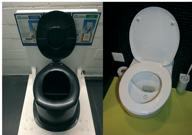
Fig. 1 The EnviroSan urine-diverting dehydration toilet (UDDT; left) and the Roediger urine-diverting flush toilet (right).

some popularity as an alternative to conventional dry toilets, especially because they give rise to less odor. 52 In Durban, South Africa, a new law obliged the municipality to provide sanitation to all from 2001, resulting in the installation of double vault UDDTs to serve the areas without sewers. 53 With urine infiltrating the ground and alternate use of the feces-containing vaults, it was possible to evacuate the vaults in a relatively safe way to gain organic matter for soil improvement. However, whereas Europeans are largely in favor of urine-separating flush toilets, albeit quite critical with respect to the toilet technology available, 51 the UDDTs are not at all popular in Durban. 54 With the flush toilet being the standard solution in the affluent parts of Durban, the affected population considers dry sanitation an unattractive and unjust solution for the poor. 55