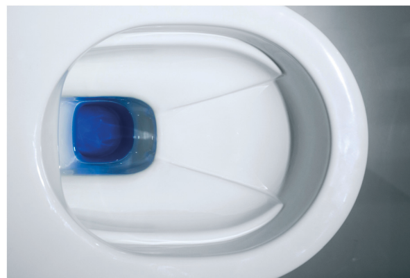
Fig. 3 The urine-separating toilet safe! from LAUFEN, implementing the urine trap. The special structures at the front-end of the toilet direct the urine towards the (nearly invisible) urine trap. 112 123