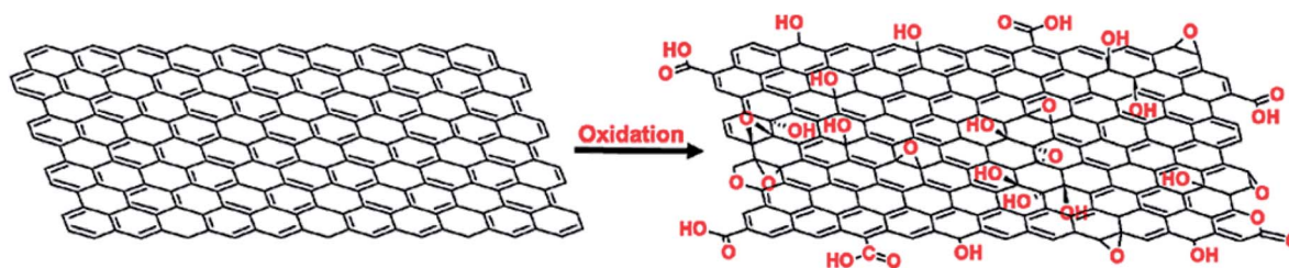
Fig. 2 Oxidation of graphene sheet to form graphene oxide. This figure has been reproduced from ref. 43 with permission from Chem. Rev. , Copyright 2016.