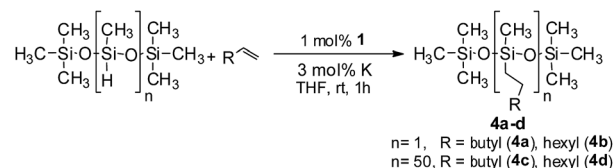
Scheme 3 The hydrosilylation of olefins by siloxanes.

a Reaction conditions: 1 (0.5 mol%), K (1.5 mol%), alkene 1 (0.5 mmol), \text{RSiH}_3 (1 equiv.), alkene 2 (0.5 mmol), THF (1 mL), rt. b Isolated yields after purification by column chromatography. c t = 6 h.