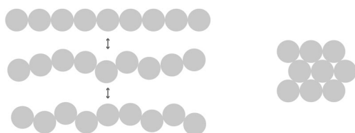
Fig. 3 Left, a flexible linear molecule that can fluctuate between high-symmetry (top) and low-symmetry (middle, bottom) conformations without changing its bond network. Right, a symmetric isomer. If our experiment does not distinguish between the various states on the left and only counts the abundance of any conformation on the left versus the one on the right, we must assign a symmetry number of 2 to the flexible molecule, even though it spends most of its time in asymmetric conformations.

The broader point here is that our statistical mechanical models must be consistent with the types of observation we make, since those observations define the macrostate to be modeled. Consider, for example, a flexible colloidal molecule that can fluctuate between symmetric and asymmetric conformations without changing its bond topology (Fig. 3). Does such a molecule have a symmetry number, given that it spends most of the time in asymmetric conformations? The answer depends on what we observe. If our experiment measures only the concentration of this molecule relative to other isomers, then the symmetry number must appear in our calculation, because it accounts for how identical conformations can be reached by permuting particles followed by either rotation or flexing. 21 This example shows that the symmetry number is more generally understood as a property of the topology of the bond network of a molecule rather than its geometry. This may seem like a deep statement, but it is really a definition that follows from what experiments typically measure (and what they do not). Put differently, we have chosen to treat all three states of the chain in Fig. 3 as states of the same molecule, not different molecules, and we must calculate the symmetry number accordingly.