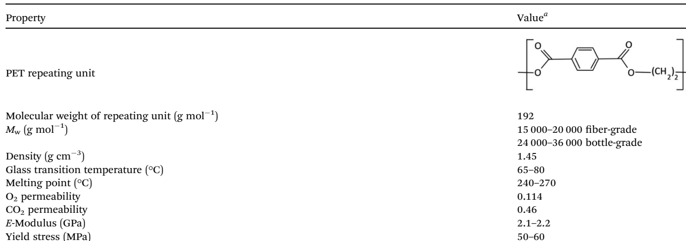
Table 2 The physical and chemical properties of PET

The environmental management policies and regulatory systems in the United States are primarily divided into the federal level and local level. The United States' Environmental Protection Agency (EPA) issued the Resource Conservation and Recovery Act (RCRA), which established the 4R principle (Recovery, Recycle, Reuse, Reduction). This principle regulates the management and treatment of waste, including the recycling and utilization of PET bottles. 27 The Superfund Law provides detailed provisions on waste treatment technologies, coordination of regulations among states, expansion of EPA authority, and increased national funding investment. It has played a significant role in promoting comprehensive recycling and utilization of waste and national environmental protection in the United States. In 10 states, including California, a deposit