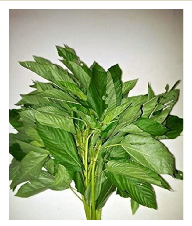
Fig. 1 C. olitorius leaves.

C. olitorius has been shown to have wide spectrum of biological activities, which is certainly related to its phytochemical