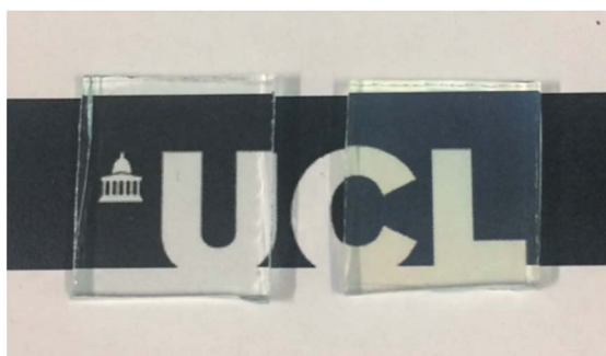
Fig. 2 Photograph of bare glass (left) and 7 mol% \text{FeCl}_3 loaded ZnO film (right).

All the films had good adhesion to the substrate, passing the Scotch tape test and steel scalpel scratch test. The films showed