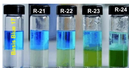
Fig. 6 Visualization of the \text{Cl}^- extraction by the receptors R-21 to R-24 using Basic Blue 17 (top layer: aqueous solution, bottom layer: \text{CH}_2\text{Cl}_2 ). (Reproduced with permission from ref. 51. Copyright 2018, Wiley.)

capable of extracting the TBA salt of halide ions from a water medium. The extraction capacity was found to be dependent on the number of donor sites present in the receptors. Both R-21 and R-22 exhibited the ability to selectively extract \text{Cl}^- from an aqueous phase into \text{CH}_2\text{Cl}_2 . In contrast, pentacalix[4]pyrrole receptors R-23 and R-24 not only extracted the \text{Cl}^- but were also capable of extracting \text{F}^- . To visualize the \text{Cl}^- extraction by the receptors under interfacial aqueous–organic conditions a water-soluble dye, Basic Blue 17, was utilized where \text{Cl}^- was present as a counter ion (Fig. 6). 52 The result revealed that R-24 achieved the highest efficiency, with a remarkable 94% extraction compared to other receptors. Furthermore, the enhanced extraction ability of R-24 was attributed to the cooperative effect of the number of individual calixpyrrole units within its structure, which was established through NMR and thermogravimetric analyses.