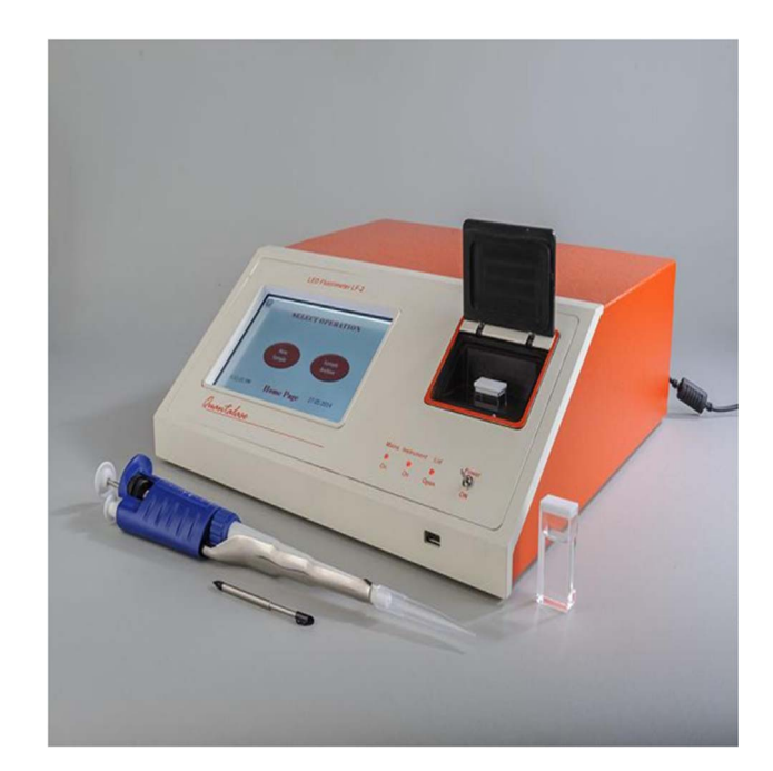
Fig. 2 LED fluorimeter (model LF-2) (QUANTALASE, India)

reconnaissance surveys for field and base laboratory investigations (Fig. 2).