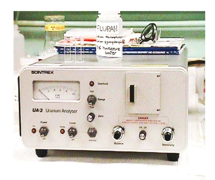
Fig. 1 UA-3 uranium analyzer (SCINTREX, Canada).

cost, simple and direct determination of uranium at \mu g~L^{-1} levels in natural water samples for hydro-geochemical reconnaissance surveys for uranium. These are critically evaluated and discussed in depth by Rathore.<sup>21</sup>