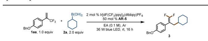
Table 1 Optimization of conditions for defluorinative alkylation of 1-(benzyloxy)-4-(3,3,3-trifluoroprop-1-en-2-yl)benzene ( 1aa ) with cyclohexylboronic acid ( 2a ) a

With the optimized conditions in hand, and convincing evidence for the proposed mechanism, we set out to study the scope of the reaction with respect to alkylboronic acid (Fig. 3). The conditions were broadly applicable for defluorinative alkylation reactions of 1aa and showed outstanding selectivity and functional group compatibility. Various primary boronic acids, including halogenated long-chain alkylboronic acids and an iodine-substituted aromatic alkylboronic acid, were suitable substrates; the desired products ( 4–9 ) were obtained in 72–82% yields. Two secondary boronic acids gave 10 and 11 in 87% and 85% yields, respectively, which were slightly higher than the