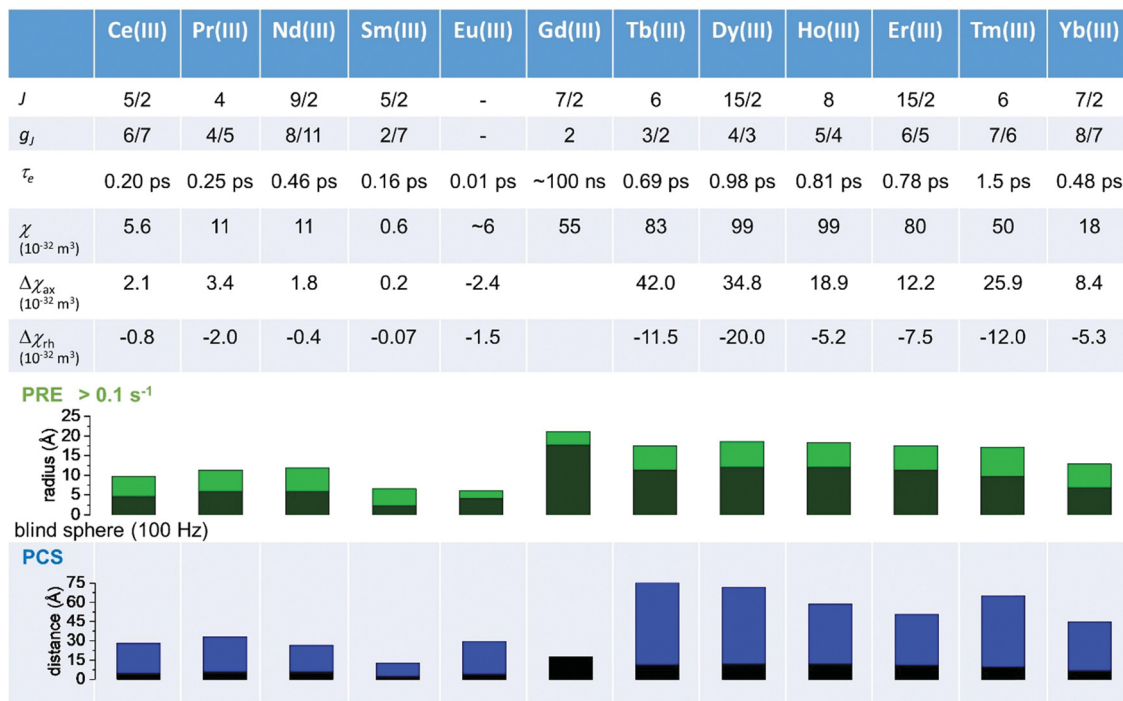
Fig. 2 Typical values of electron relaxation time ( \tau_e ), magnetic susceptibility ( \chi ) and axial and rhombic anisotropy ( \Delta\chi_{ax} and \Delta\chi_{rh} ) of lanthanoid ions. The typical radii of blind spheres (black) and spheres with ^1\text{H} PREs larger than 0.1 \text{ s}^{-1} (green), and the maximum distances of nuclei in axial position with PCSs of 0.05 \text{ ppm} (blue) are also shown for a protein with the reorientation time of 10 \text{ ns} at 700 \text{ MHz} .

at 900 \text{ MHz} , and the radius of the ^1\text{H} blind spheres for the different metal ions. Blind sphere radii are also shown in Fig. 1 and 2 together with the radii of the spheres containing nuclei with R_1 ^1\text{H} PREs larger than 0.1 \text{ s}^{-1} (taken as detection limit).