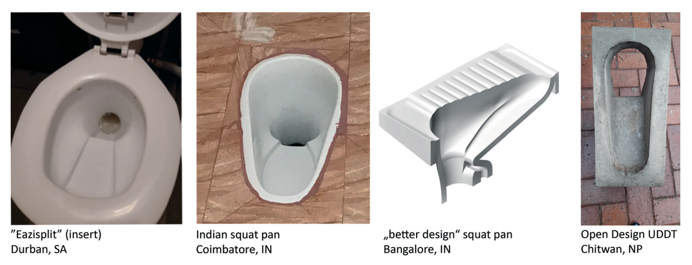
Fig. 4 Examples of the urine trap integration for low-income countries, developed by EOOS NEXT in cooperation with local and global partners. More information in ESI,† Table S2.

in buildings.<sup>57,58,67–69</sup> Introducing urine source-separating technologies into the standard curriculum of architects, plumbers and environmental engineers, as well as developing solid O&M models for on-site urine treatment system should thus be a future focus of development. Increased cooperation between firms, research institutes, authorities and artisans will be needed to develop and quickly diffuse this type of supporting social innovation in the TIS.