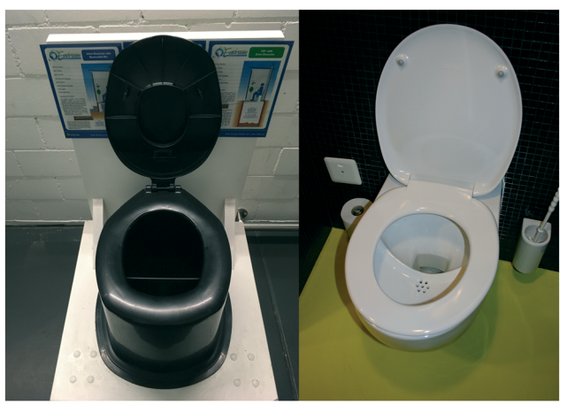
Fig. 1 The Envirosan urine-diverting dehydration toilet (UDDT; left) and the Roediger urine-diverting flush toilet (right).

Open Access Article. Published on 06 2021. Downloaded on 25/7/2024 08:35:31.