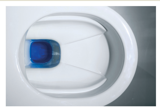
Fig. 3 The urine-separating toilet safe! from LAUFEN, implementing the urine trap. The special structures at the front-end of the toilet direct the urine towards the (nearly invisible) urine trap.<sup>112</sup> Copyright LAUFEN.<sup>123</sup>