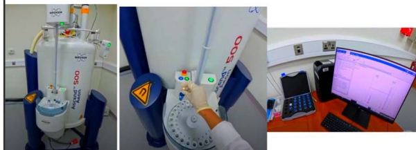
Fig. 5 Screenshot examples of VR videos.

While students initiated the ball-milling process, they did not wait for its full duration; instead, students proceeded with the work-up and purification steps using reaction mixtures prepared in advance by the instructor or previous cohorts. The VR visualization condensed the synthesis step, which typically takes approximately 60 min under real laboratory conditions, into a brief, immersive representation, allowing students to contextualize key stages while concurrently working on other experimental steps. This approach avoids additional waste, as student-initiated samples are retained and used by subsequent cohorts, ensuring continuity of the workflow. The student-prepared ball-milled mixtures were retained for use in subsequent sessions. This integrated workflow ensured efficient use of laboratory time while maintaining student engagement with all key experimental stages from reaction preparation and mechanical grinding to product isolation and purification.