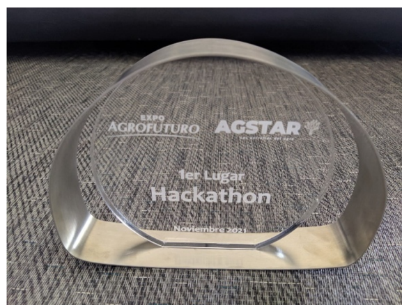
Fig. 2 “Hackathon AGSTAR 2021” price.

Some representative projects demonstrate how green chemistry principles have been implemented in educational