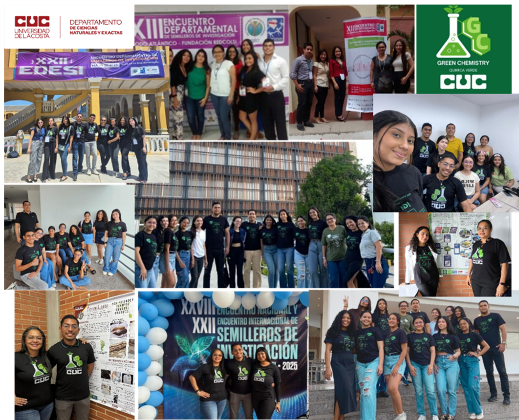
Fig. 1 Green chemistry research hotbed – a decade.

development of the research process, including proposal formulation, methodological design, experimental implementation, data analysis, and preparation of the final report, ensuring academic and methodological rigor. The students present their final work before a jury evaluator. The jury evaluators are faculty members from the Environmental Engineering program whose academic experience and thematic expertise are aligned with the project topic. They are responsible for assessing the written final report and the oral defense based on previously established evaluation criteria. The students have the autonomy to decide on the focus of their work, and the tutors play the role of an expert guide throughout the process, providing guidance and assistance as needed.