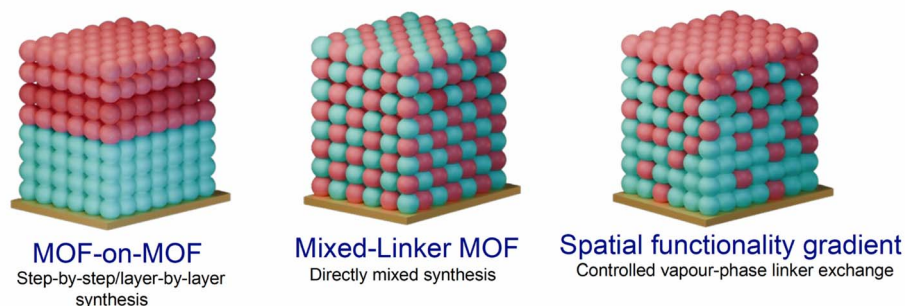
Scheme 1 A schematic illustration of mixed-linker MOF structures with different possible spatial configurations and fabrication methods; left to right: MOF-on-MOF, homogeneously mixed-linker and the spatial gradient, which is demonstrated in the current work. Two differently colored spheres are used to represent different linker's presence in the MOF.

film of ZIF-8. The results revealed the formation of a unique mixed-linker ZIF-8 monolith, but not a ZIF-8_ZIF-90 mixed crystalline phase film (ZIF-90 is made of \text{Zn}^{2+} and CHO-Im). In the monolith structure, CHO-Im was distributed according to a diffusion gradient leveraged by the vapor-phase reaction. This spatial distribution gradient significantly enhanced the molecular sieving properties of the material. Here, we detail the principle and methodology used to achieve this spatial gradient functionality in ZIF-8 and reveal its distinctive properties.