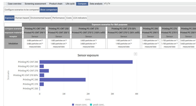
Fig. 5 Comparison of release results obtained by the air monitoring campaign performed before ( i.e. , PC-SWCNT.290) and after SbD implementations (PC-SWCNT.250, PC-SWCNT.270, and PC-SWCNT.270-50%) as well as during the production of the PC without SWCNTs ( i.e. , PC-290, PC-270, and PC-250).

Toxicological assessment. The detailed hazard assessment focused on inhalation exposure to IATA to compare the potential toxicity of the different alternatives. Information on