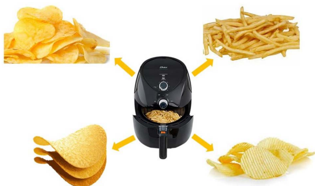
Fig. 2 Geometry of fried potato products that could be obtained with hot air frying technology.