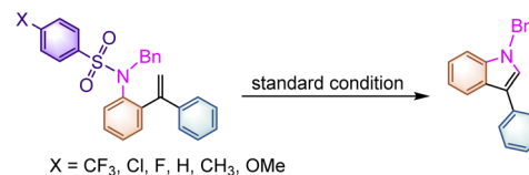
Hammett plot on para -arylsulfonyl site

To better indicate the influence of the electronic characteristics of the arylsulfonyl moiety on this reaction, the Hammett effect was examined in this system. A set of parallel reactions of 1aab , 1a , 1aw , 1az , 1aaa and 1aac bearing various substituents