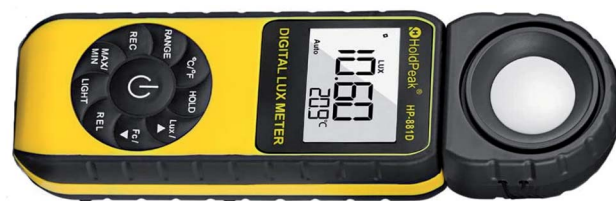
Fig. 4 Example of a common commercial lux meter.