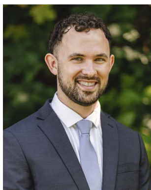
Joshua E. Barker

Fortunately, chemists have devised ways to moderate highly reactive antiaromatic molecules. For example, when Hafner attempted in the early 1970s to prepare the parent pentalene 1 (Fig. 1), a bicyclic 8 \pi -electron analogue of COT, the molecule rapidly dimerized into 2 even at -80 °C to alleviate the destabilizing paratropic ring current. 7 Bally et al. showed that this process, which is thought to occur via diradical intermediates and thus indicative of the presence of a low-lying triplet state, is reversible upon photolysis of 2 in an Ar matrix, with the photocleavage occurring in two distinct steps—formation first of a diradical then regeneration of 1 . 8 To obtain an isolable hydrocarbon, Hafner subsequently installed three t -butyl groups onto the pentalene skeleton, e.g. , 3 , thus kinetically stabilizing the molecule. 9 Kinetic stabilization with bulky