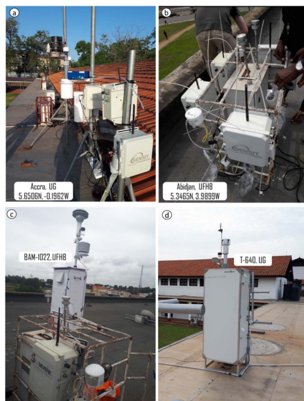
Fig. 2 Pictures of monitors, (a) RAMPs at UFHB, (b) RAMPs at UG, (c) collocation of BAM-1022 and RAMPs at UFHB, (d) Teledyne T-640 at UG.

In Accra, RAMP-1033 and RAMP-1034 were deployed from 10 March 2020 to 31 March 2021 at the atomic interchange (AI) and Kwashieman Trinity Presbyterian Church (KTPC) respectively. These two RAMPs were then later collocated for calibration with