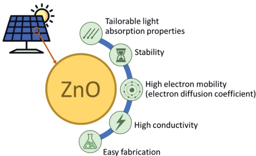
Fig. 1 The merits of ZnO for solar cell application.

have made ZnO widely applied in many areas, such as sensors, surface coating, porous ceramics, photodetectors, nanopiezoelectric, and supercapacitors, in addition to solar cells. There are also many available methods to prepare ZnO nano-materials from different pathways (biological/physical/chemical), such as green synthesis using microorganisms, hydrothermal, sol-gel, electrochemistry, inkjet printing, atomic layer deposition, and sputtering technique.