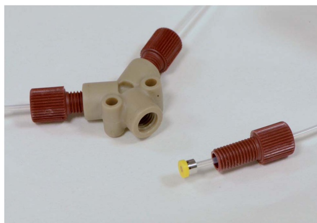
Fig. 1 Photograph of a microfluidic Y-mixer, with the outlet opened to reveal a yellow ferrule attached to the end of a length of PTFE tubing. The ferrule forms a liquid-tight seal with the Y-mixer when pressed into place by the red nut.

To connect your tubing to other flow accessories, you need to use some good quality fluidic connectors. These come in two parts: a compression-fitting called a ferrule that slips over the end of the tubing and forms a tight seal when mated with a second fluidic component; and a nut, which applies the pressure required to hold the ferrule in place. You should get a clearer idea from Fig. 1, which shows a yellow ferrule that has been slipped onto the end of a piece of PTFE tubing and would normally be held in place by the red nut. Ferrules for plastic tubing are typically made from polyether ether ketone (PEEK) or another chemically resilient plastic, and with care can be slipped from an old piece of tubing to a new one. (You won't find many suppliers encouraging you do this, but reusing ferrules works just fine and will save you a fair amount of money.) Various styles of ferrule exist: we like the ‘Super Flangeless’ ones as they stop the tubing from twisting as the nut is screwed in. Ferrules are a sure-fire way of making fast fluidic connections: with practice, you can cobble everything together in a matter of minutes, and you'll still find it's good enough to withstand 30 bar pressures.