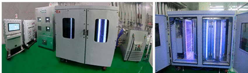
Fig. 15 Pictures of the production-scale photochemical skid. Reproduced from ref. 249 with permission from American Chemical Society.

complicated when considering the rapidly changing renewable and sustainable energy landscape associated with the net zero transition. That transition is multi-faceted and complex, and as a result requires solutions which are not just interdisciplinary in nature but capable of achieving an impact across social, economic, environmental and technological platforms. The role and impact of technologies such as photocatalysis will have within that will always be debated, as an emerging technology by its nature requires support to achieve further development and deployment. It's crucial that support facilitates growth, rather than perpetuating a level of academic stagnation or a continued hype cycle which is often associated with trying to develop the 'perfect' material. Moreover, this support must be contextualised in relation to other emerging technologies, as well as those at higher TRLs, which face manufacturing and deployment challenges. Put simply, there may not be enough resources to support all emerging technologies which can contribute towards our low-carbon and net zero targets. It is therefore vital that technologies such as photocatalysis can be evaluated and monitored with a view towards developing a strategy for TRL advancement. This includes assessing the current status, which is frequently done within the literature, and coupling that with identifying research priorities to support growth.