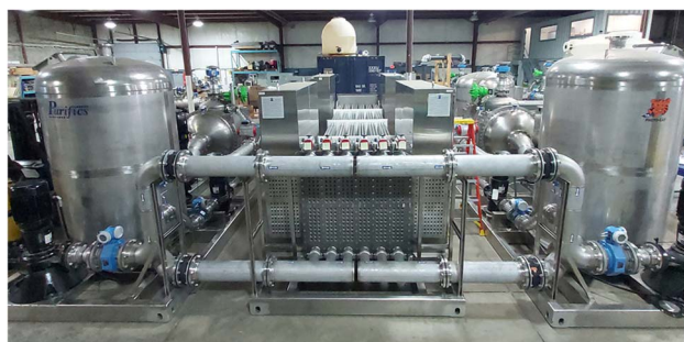
Fig. 13 Reactor technology from Purifics reproduced from ref. 247 with permission from Purifics.

Imoberdorf et al. 248 designed a scaled up multi-annular photocatalytic reactor for the photocatalytic oxidation of