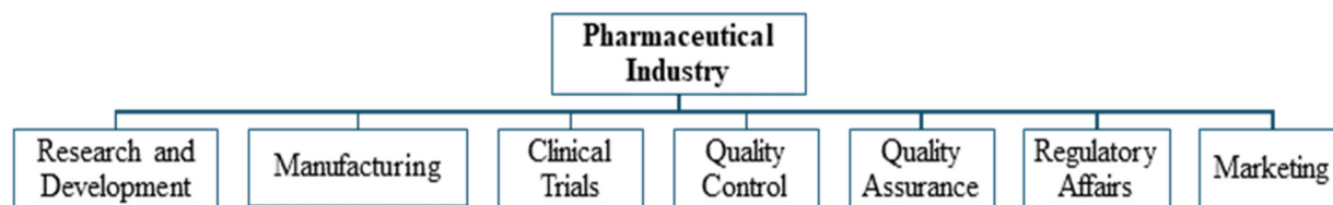
Fig. 2 Different processes involved in the pharmaceutical industry where AI can be potentially applied.