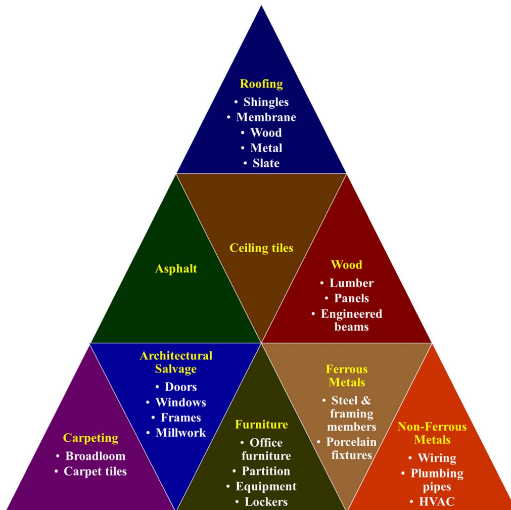
Fig. 3 Sources of construction and demolition waste. 24

of the unit and waste generation. For instance, the percentage of waste contribution against precast concrete's overall manufacturing is calculated to be 2.96, 4.45, and 6.07% for large, medium, and small-scale operations, respectively.