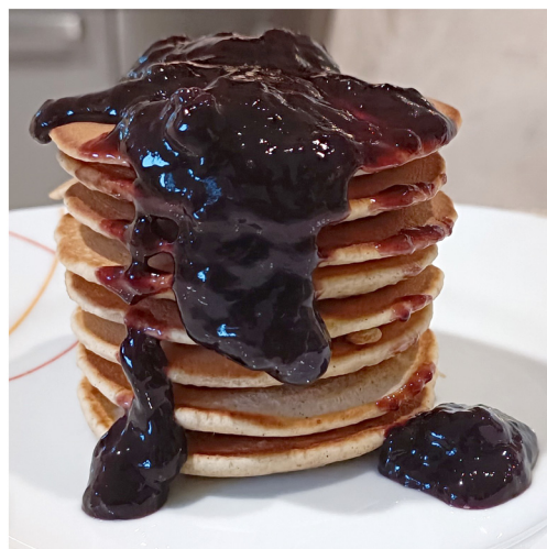
Fig. 2 A stack of pancakes resembling a stack of planar radicals. The electrons act similarly to jam in the figure, holding the radicals together. Pancakes and photo by P. Stanić.

The prototype of the pancake bond is a dimer of closely interacting radicals, which is found in numerous compounds, such as neutral phenalenyls 41,42 and dithiadiazolyls, 10,40,43 cations such as perylene 38 and fused-ring acenes, 44 and anions such as semiquinones 45 and TCNQ. 39 When two radicals, each with a single unpaired electron, make close contact, these two electrons couple, forming a single bonding pair (Fig. 1). This corresponds to a single covalent bond. However, there are not necessarily two bonding electrons in a pancake bond.