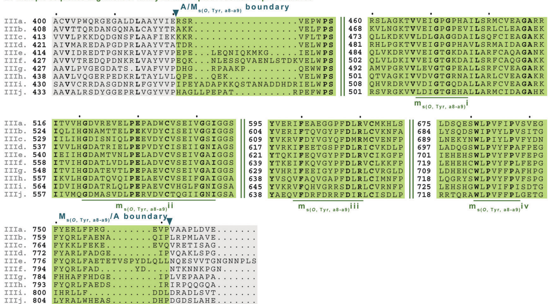
Fig. 7 Multiple sequence alignments of (A) family 2a (type II M domain) interrupted A domain representatives as noted in Fig. S2, ES1† and (B) family 2b (type III M domain) interrupted A domain representatives as noted in Fig. S3 (ES1†). Types II and III M domains are highlighted in light blue and light green, respectively. The A domain is highlighted in light grey. The conserved M domain motifs for types II and III M domains are underlined in dark blue and dark green, respectively. The boundaries between the domains are indicated by a triangle. Breaks in the sequences are indicated by two parallel bars. The full sequence alignments and accession numbers are presented in Fig. S14 and S15 (ES1†).

A domains embedding multiple M domains, families 5a/b and 7, respectively, which is discussed below in the “Interrupted A domains with multiple M domains: backbone N - and side chain O -methylation” section.