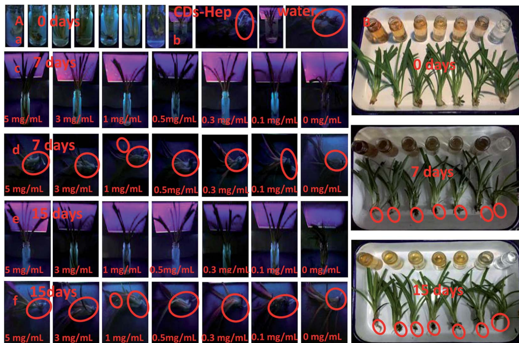
Fig. 6 (A) Optical images of the different developmental stages of a spider plant cultured in water containing different concentrations of CDs (a, c–f) and CDs–Hep (b) ( 5.0 \text{ mg mL}^{-1} ) under UV lamp illumination with excitation at 365 \text{ nm} . (B) Optical images of the different developmental stages of spider plant raised in an aqueous solution of the CDs (0, 0.1, 0.3, 0.5, 1, 3, and 5.0 \text{ mg mL}^{-1} ).

epidermis. More significantly, the leaf, root, and stem were the brightest parts of the spider plant. This indicates that the CDs can enter the spider plant through absorption at the root and stem. The nanoscale and high-water solubility of the CDs make them absorbable and the CDs were easily distributed into the spider plant tissues.