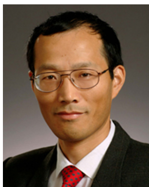
Z. Hugh Fan

The impact of this pioneering paper is partially indicated by its >1500 citations according to Clarivate's Web of Science (or >2600 citations according to Google Scholar). Fig. 1 shows the number of publications citing the paper in each year from 1993 to 2023, indicating its rapidly escalating impact during the first decade of its publication and continuous influence in the second decade.