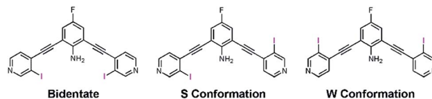
Fig. 2 ChemDraw representations of the three planar conformations obtained by rotating about the alkyne bonds: the bidentate conformation (left), where both XB donors are convergent; the S conformation (middle), where the XB donors are on opposite sides of the molecule; and the W conformation (right), where both XBs are directed away from the amine.

Recently our lab developed a bisethynyl receptor that binds anions and neutral Lewis bases with two iodopyridinium XB donors. 88,89 The alkynes promote rigidity and directionality, but their low rotational barrier allows the receptors to adopt three planar binding conformations (Fig. 2). Our interest in bidentate XB interactions prompted us to preorganize the receptor.