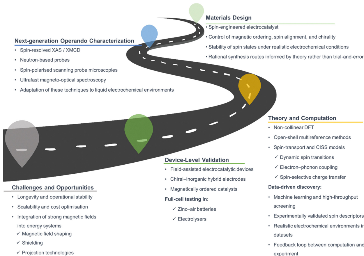
Fig. 12 Roadmap to practical spin-controlled electrocatalysts.

On the journey to practical applications, there are opportunities to study longevity, scalability, and cost optimisation of such systems. In addition, the challenge of incorporating