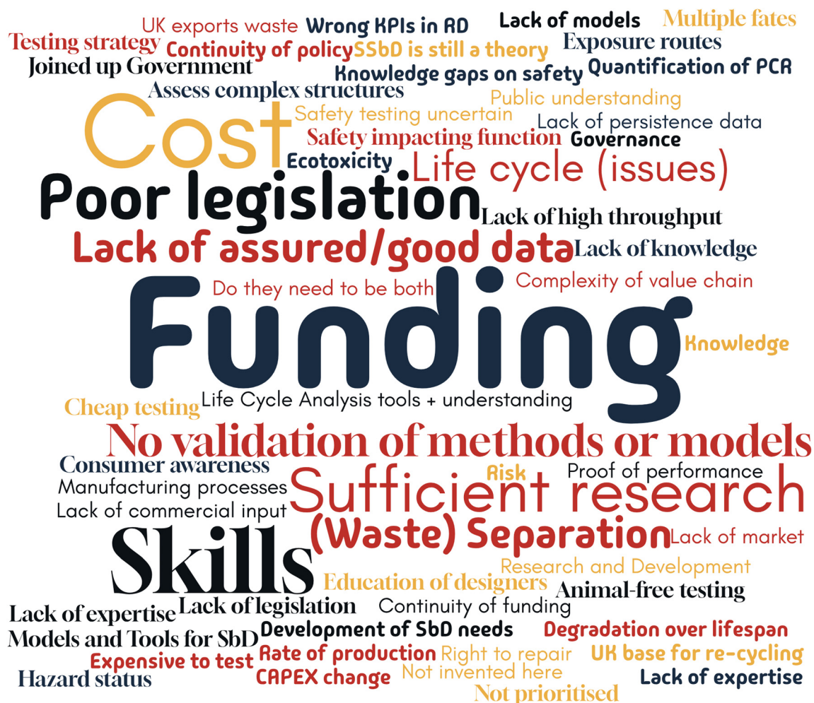
Fig. 2 Word cloud response to the question – What are the barriers to create Advanced Materials that are both safe and sustainable by design? (81 responses). Note that limited preprocessing of responses was undertaken prior to generating word clouds to group similar terms and harmonise.

• Developing the skills of engineers in using SSbD tools.