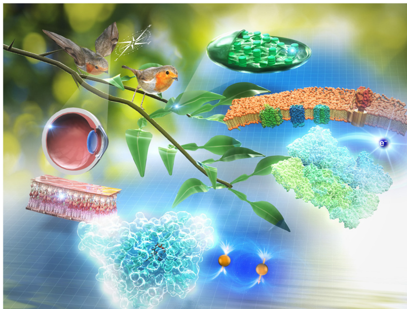
Fig. 8 Conceptual diagram of quantum biology and quantum biotechnology. Quantum effects which play a critical role in a variety of biological functions, including photosynthesis, magnetoreception, and enzymatic reactions. Their mechanisms are not well understood and are a hot topic in quantum biology.

state ( ^{\delta}[FAD^{\bullet-} TrpH^{\bullet+}] ) and triplet (T) state ( ^T[FAD^{\bullet-} TrpH^{\bullet+}] ) under the influence of intramolecular electron–nuclear hyperfine interactions (“Intersystem crossing A” in Fig. 9a). The relative angle between the external magnetic field line and the composite RP can affect the extent and frequency of the S–T mixing process, which could alter the quantum yield of the subsequent, stabilized RP ( ^{\delta,T}[FADH^{\bullet} Trp^{\bullet}] in Fig. 9a) that consists of a neutral semiquinone radical ( FADH^{\bullet} ) and a neutral Trp radical ( Trp^{\bullet} ). 218,228,229 Several spectroscopic analyses, such as transient absorption analysis near 50 \mu T , revealed that the reaction process from the composite RP to the stabilized RP proceeds over a time scale of 1 to 10 \mu s . 213,225 This time scale is longer than required to receive geomagnetic information (approximately one \mu s in vivo ). 225 The quantum yield of the stabilized RP altered by the magnetic field effect could trigger the magnetic signaling from CRY4 to the nervous system, probably through the assistance from Tyr319, the conformational change in the C-terminal tail accompanying the change in the interaction to unknown CRY receptors. 216,217,230 This RP mechanism also called the “CRY hypothesis,” is now widely believed to be the first step in geomagnetic sensing. 213,216,231–233