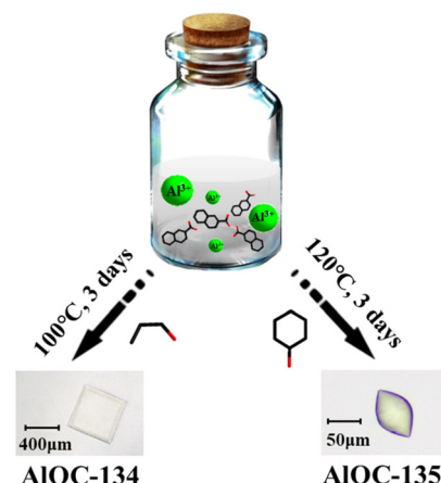
Fig. 1 “Ligand-induced aggregation and solvent regulation” synthesis of AIOC-134 and AIOC-135 .

Single-crystal X-ray diffraction (SCXRD) showed the compound AIOC-134 crystallizing in the monoclinic space group C2/c with a total diameter of 3.1 nm, a height of about 1.9 nm, and a central hole of 0.5 nm (Fig. 2a and c). The entire molecular ring includes 16 \text{Al}^{3+} ions, 24 2-NA ligands, 16 ^i\text{OPr} , and eight bridged hydroxyl connections (Fig. 2a). Each aluminum ion